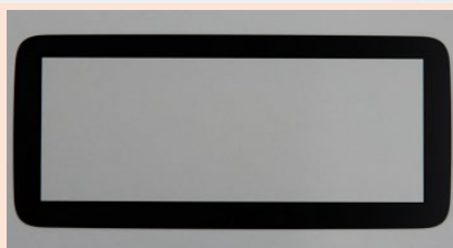
Printing on flat display panel